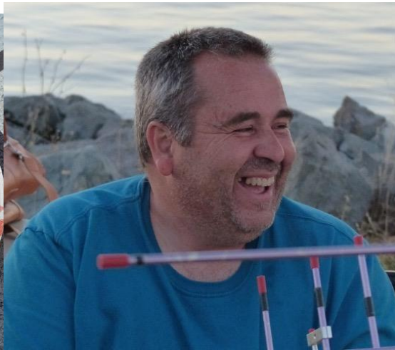
Breakfast is served and the chef is happy.